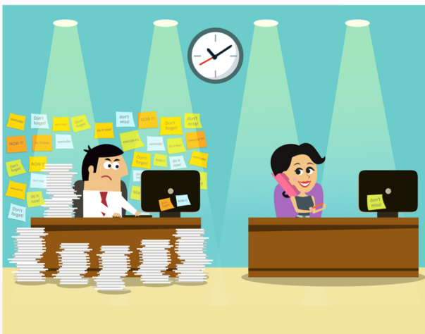
HOW TO MANAGE BIAS IN YOUR ORGANIZATION FOR BETTER DECISIONS